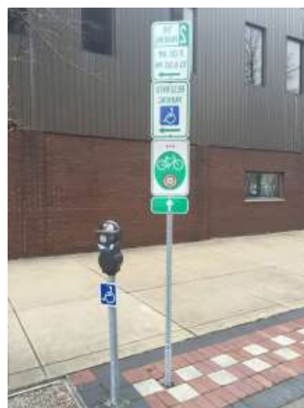
On-road Erie Canalway Trail route signage, installed on Water Street, in Syracuse, 2015.

The Syracuse Metropolitan Transportation Council (SMTC) continued work on Part II of the Erie Canalway Trail - Syracuse Connector Route Project on behalf of the City of Syracuse. In 2015, the Study Advisory Committee (SAC) reviewed several routing options for the permanent ECT route from Camillus to Dewitt, eventually asking for comments on three final options along with section drawings and perspectives for locations along Erie Boulevard East. The final route options and comments were presented at a public meeting in December. The final step of the project will consist of SMTC staff incorporating public comments into a final report.