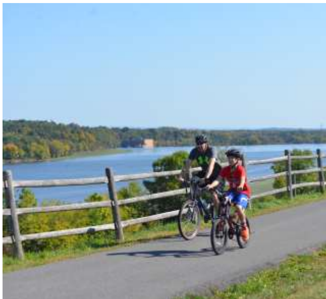
Cyclists enjoy the Erie Canalway Trail in the Mohawk Valley.

Canalway Trail to achieve its full potential for visitors and residents, it is essential that it be complete. In the case of the American Tobacco Trail, research conducted by the Institute for Transportation Research and Education found that after construction of a bridge joining the northern and southern