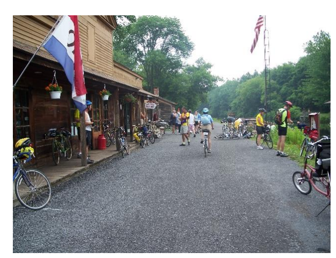
Cyclists rest along the Erie Canalway Trail in Camillus.

In 2014, PTNY released the first comprehensive study of the Erie Canalway Trail visitor, The Economic Impact of the Erie Canalway Trail: An Assessment and User Profile of New York's Longest Multi-use Trail. The study, which was funded in-part through grants from the New York State Canal Corporation and the Erie Canalway National Heritage Corridor, demonstrated that presently the trail receives an annual trail traffic volume of more than 1.58 million visits per year,