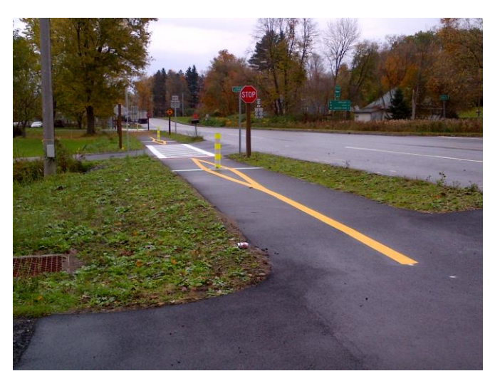
Newly-constructed Erie Canalway Trail segment in Rome.

The NYS Canal Corporation completed approximately three miles of trail in the City of Rome in Oneida County between the Gryziec Field parking area and the trailhead at Rome-Oriskany Road in Stanwix. The project was funded by the 2005 NYS Transportation Bond Act.