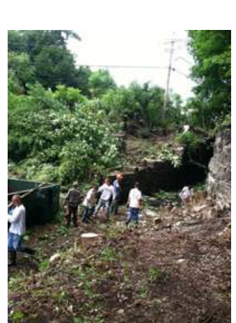
Volunteers clean out the Delaware Avenue tunnel

Recently, the city, KLT, and the Trolley Museum of New York worked together to revise a lease for a 1.5-