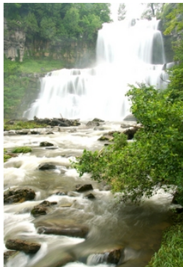
Chittenango Falls State Park

New York State Parks generate substantial net economic benefits for the people and economy of the Empire State. On a statewide basis, direct spending by OPRHP and spending by visitors to state parks supports up to $1.9 billion in output and sales, $440 million in employment income, and 20,000 jobs. These benefits are distributed among the 11 regions that constitute the State Park System according to the number, size, and nature of the parks and historic sites in the various regions.