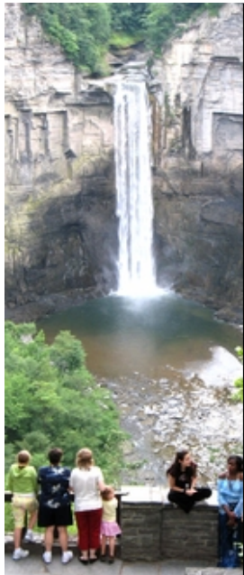
Taughannock Falls State Park