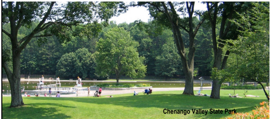
Chenango Valley State Park

The primary focus of this report is the State Park System. However, the activities of OPRHP, as a state agency, are not restricted to state parks and historic sites. They include organizing the Empire State Games; administering the state recreational boating program; oversight of over 10,000 miles of snowmobile trails; administering local grants-in-aid programs which support park and recreational trail development by community groups and municipalities; and overseeing the state's historic preservation programs. All of these activities generate economic benefits for local and state economies – from promoting tourism to raising property values.